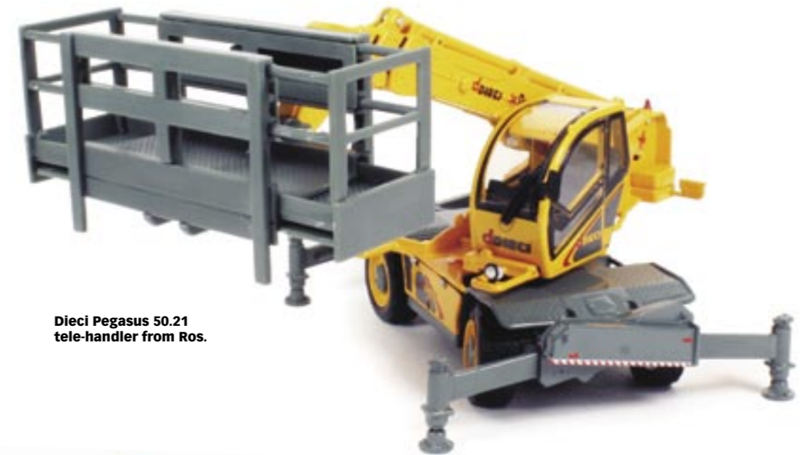
Dieci Pegasus 50.21 tele-handler from Ros.