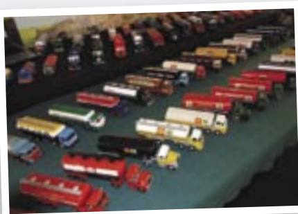
Below How many Corgi tankers can you see?

as specialised dealers in photographs and literature, including brochures and books.