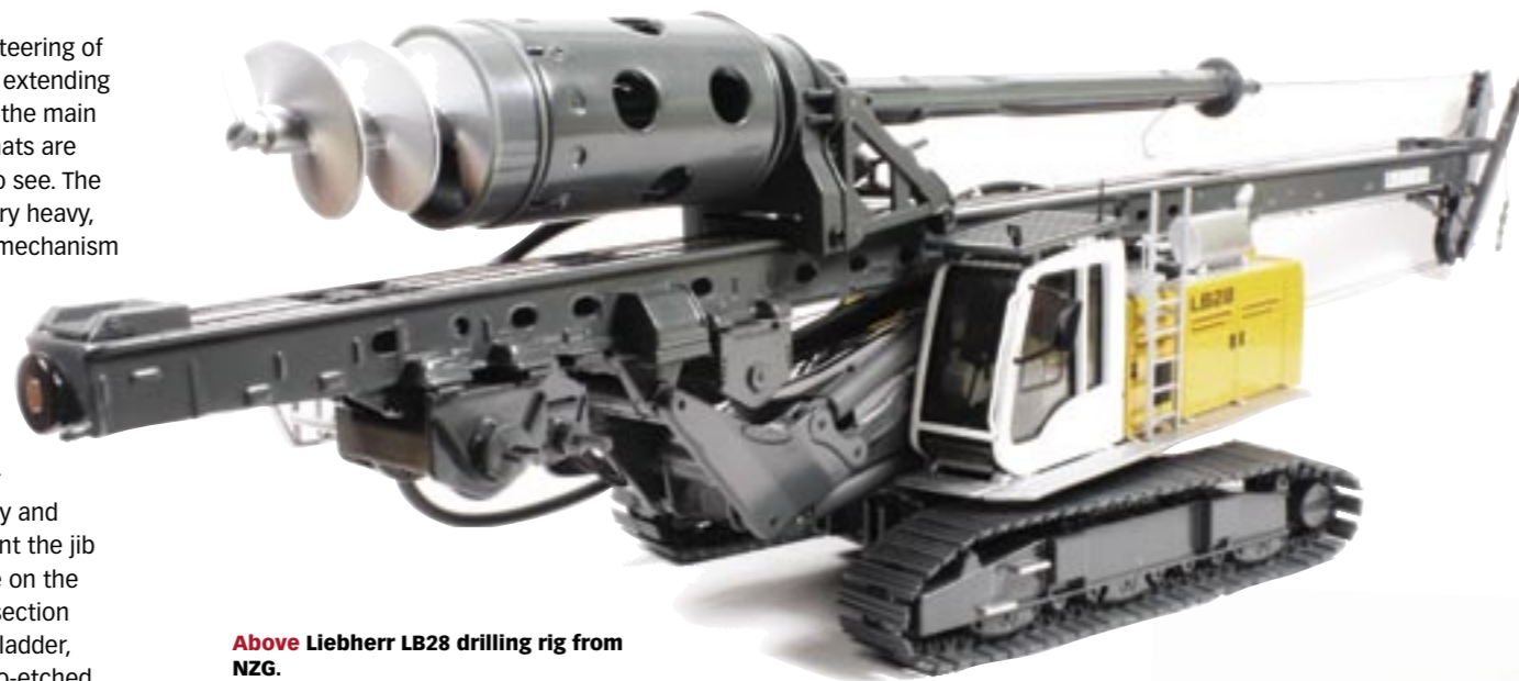
Above Liebherr LB28 drilling rig from NZG.

The new version of the Liebherr 630EC-H40 tower crane from Conrad, the largest 1/50 scale tower crane so far produced was on display and features new pennant lines to prevent the jib from drooping which was noticeable on the previous version. Each lattice mast section has an integral platform and access ladder, complete with safety cage and photo-etched walkways have been added along the entire length of the jib. The model can be configured with single or double lifting block and the trolley traverses smoothly along the jib.