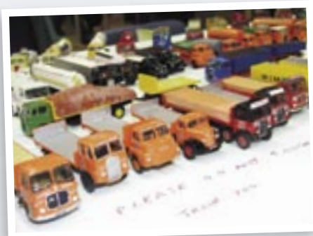
Right Robby Holmes' forestry diorama.

Terex and Caterpillar models, including developments and conversions of standard models, incorporating a high level of additional detailing.