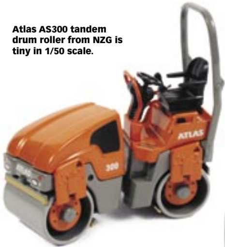
Atlas AS300 tandem drum roller from NZG is tiny in 1/50 scale.

drilling rig is another good release from NZG with poseable boom, adjustable drilling auger and Kelly bar and extending track frames with metal linked tracks.