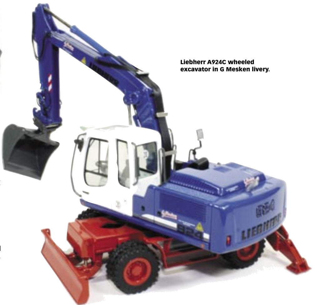
Liebherr A924C wheeled excavator in G Mesken livery.

Norscot has unveiled its new range of Caterpillar tracked and wheeled pavers and a sample of the AP655D tracked paver with canopy was displayed, featuring an extending screed, rotating rubber tracks and tipping hopper sides. Another recent release