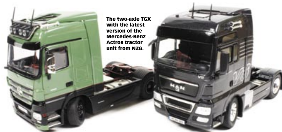
The two-axle TGX with the latest version of the Mercedes-Benz Actros tractor unit from NZG.