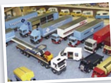
Above and right Just some of the many models displayed by members of the North East Diecast Collectors Club.

them to represent vehicles once in the Wimpey fleet.