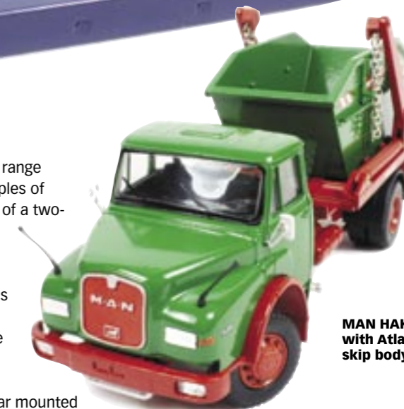
MAN HAK with Atlas skip body.

Fresh from Nuremberg NZG recently announced its new range of MAN trucks and several examples of these were displayed, consisting of a two-axle TGX V8 in black, a three-axle TGX 6x4 with Nootboom Pendel X trailer in an Anthracite colour scheme and three versions of the TGX 8x4 heavy haulage prime mover, including an orange R6 version with rear tank and a chrome and company liveried version of the V8 version with rear mounted