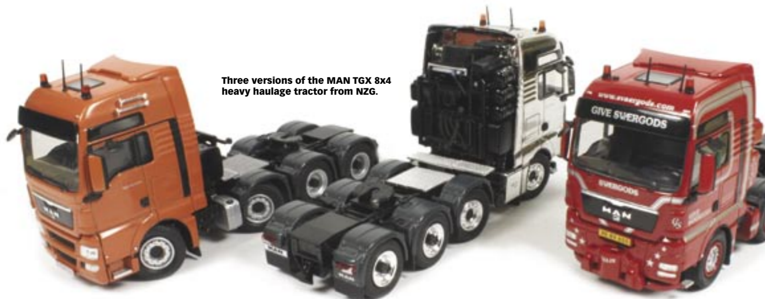
Three versions of the MAN TGX 8x4 heavy haulage tractor from NZG.