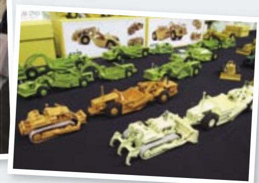
Some of Bruce Ralston's Terex plant models.