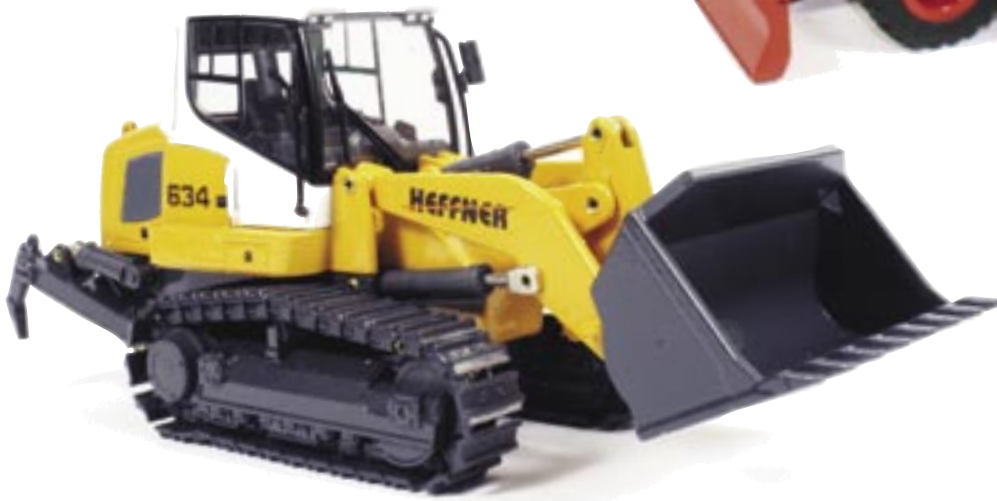
Liebherr LR634 tracked loader in Heffner livery.

from Norscot is a highly detailed 1/25 scale replica of the Cat G3516 Gas Engine.