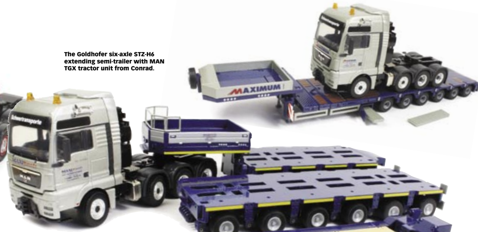
The Goldhofer six-axle STZ-H6 extending semi-trailer with MAN TGX tractor unit from Conrad.