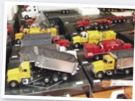
Above Part of the display of TWH and Sword Models on Steve Bates' trade stand. Left Foden S70 in Metropolitan Water Board livery.

Each year, there are more displays by collectors and modellers of their model fleets. The standard of modelling and presentation has been universally high. We have seen some of the models at previous truck and plant shows and it was good to have the opportunity of another look at them, while there were many that have not been seen before. The exhibitors came from all over the