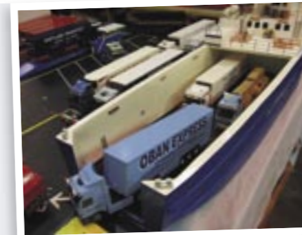
Trucks re-finished in Scottish liveries on Robbie Holmes' Northlink Ferry.

There were also plenty of models for sale as well, with traders putting on special displays of model trucks and plant, as well