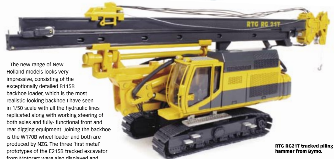
RTG RG21T tracked piling hammer from Bymo.

The new range of New Holland models looks very impressive, consisting of the exceptionally detailed B115B backhoe loader, which is the most realistic-looking backhoe I have seen in 1/50 scale with all the hydraulic lines replicated along with working steering of both axles and fully-functional front and rear digging equipment. Joining the backhoe is the W170B wheel loader and both are produced by NZG. The three 'first metal' prototypes of the E215B tracked excavator from Motorart were also displayed and have some interesting boom options.