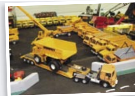
Left and below Two views of Ian Maclean's large display of 1/50 scale vehicles in Wimpey livery, mainly clever conversions of different diecast models.

UK, from the North of Scotland to the South Coast. Both halls at Spalding's Springfields Exhibition Centre were in use, the smaller hall containing a large 'play-pen' demonstration area, for the radio-controlled model truck enthusiasts to operate their large-scale vehicles. Complete with realistic sound systems, they manoeuvred around each other, as well as escaping to 'drive' around both halls from time to time... A large display, including a depot and a quarry, was mounted by Ian Maclean from near Inverness, with a whole fleet of 1/50