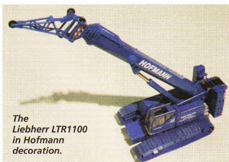
The Liebherr LTR1100 in Hofmann decoration.

A number of new truck models were on display including both Euro 5 and the