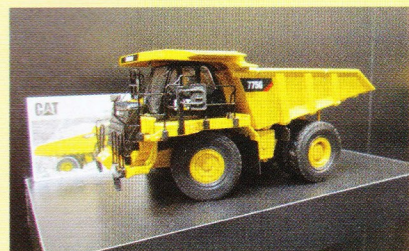
The Cat 775G.

The addition of a new Kobelco crane licence saw the launch of the 2250 tracked lattice boom crawler which should be available from April onwards while another new licensee is Nootboom with several new trailers under development.