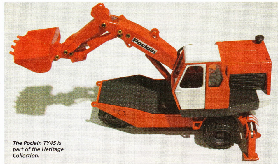
The Poclair TY45 is part of the Heritage Collection.