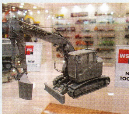
The Liebherr R914 compact excavator.

The most striking of the new announcements are a pair of Liebherr excavator models, the largest of which is the R970 configured for mass excavation duties while the small R914 compact shows excellent promise. Both are expected to be released towards the end of 2014.