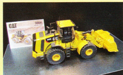
The Cat 966K.