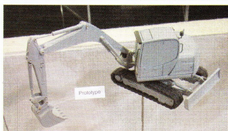
The Terex TC125 prototype.

A new range of Mercedes-Benz Arocs trucks is planned for release during 2014 with the distinctive front grill authentically modelled. The four-axle chassis will appear with several different body options including half-pipe and Meiller tippers while a concrete mixer body version is also planned. For the first time, NZG will be able to offer right-hand drive versions of the trucks opening the possibility for UK-decorated models to be realised.