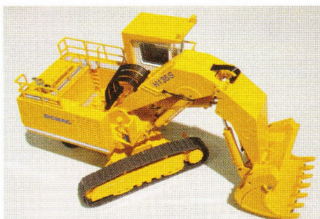
The Demag H135 has fixed hydraulic lines and linked metal tracks.

Mercedes-Benz four-axle trucks with Brechtel wrecker and sewer cleaning bodies were also displayed.